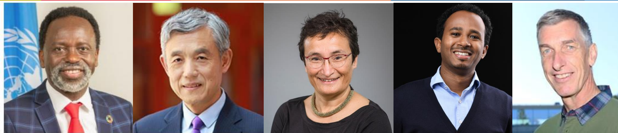
Tshilidzi Marwala Rector, United Nations University Under-Secretary-General, United Nations