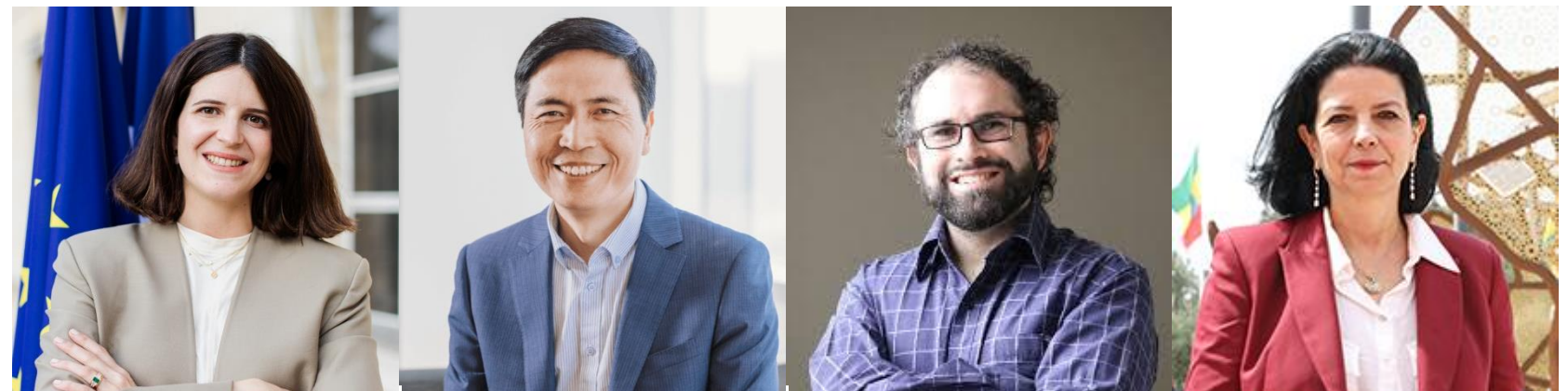
Clara Chappaz Minister of State for Digital Affairs of France