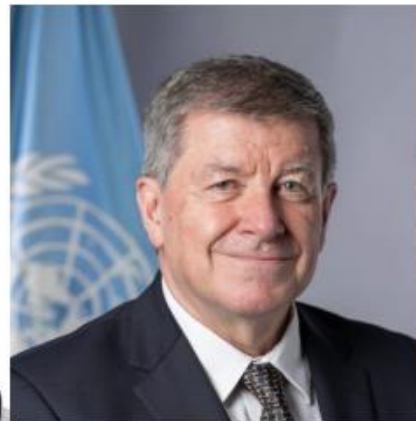
Guy Bernard Ryder Under-Secretary-General for Policy Executive Office of the Secretary-General United Nations