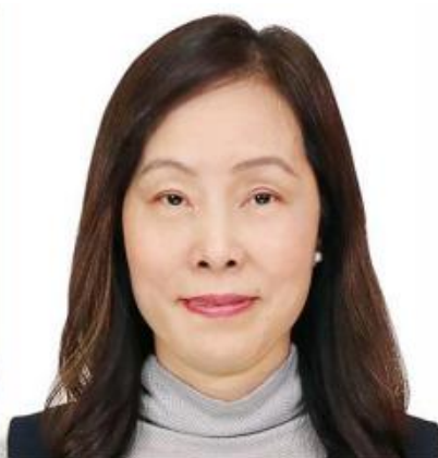
Ao Ieong U Secretary for Social Affairs and Culture of the Macao SAR Government