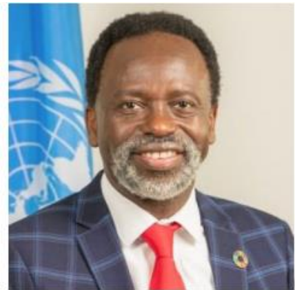
Tshilidzi Marwala Rector, United Nations University Under-Secretary-General, United Nations