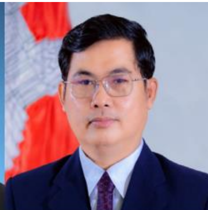
Neang Mao Under Secretary of State Ministry of Post and Telecommunications of Cambodia