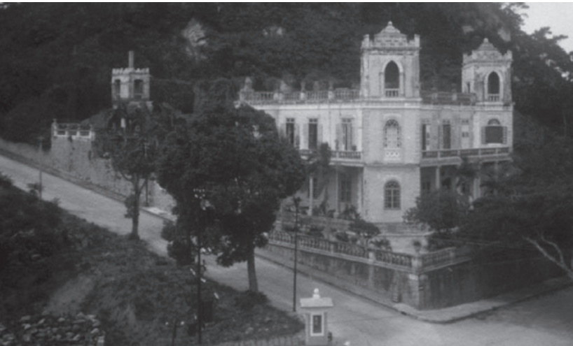
Old photograph of Casa Silva Mendes.