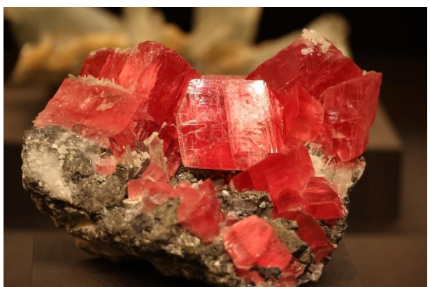
Terra Mineralia, one of the largest mineral collections in the world, Freiberg (Ore Mountains)

If you have time to venture deeper into Saxony or even visit our European neighbors, the websites of <u>Upper Lusatia Tourism</u>, <u>Ore Mountains Tourism</u>, <u>Visit Czechia</u> and <u>Poland Travel</u> can provide more inspirations.