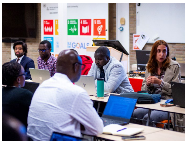
Picture above: MMDP Participants engage in a debate session on brain drain

The first aspects covered in this course are migration definitions, concepts and statistics. Also on the agenda are the main international conventions relevant to the management and protection of migrants. The course begins with an introduction to migration studies which includes an overview of data, flows, and types of migrants, as well as the various kinds of organisations working in migration management and protection.