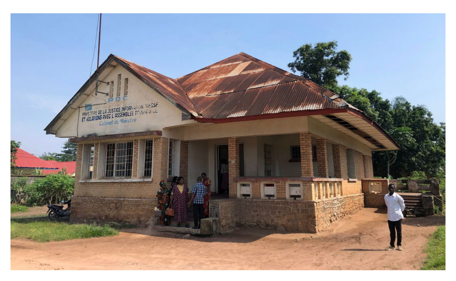
One of the strengths of the PAJURR project was that it took a multidimensional approach to transitional justice, not only engaging stakeholders on creating a subnational Truth Commission, but working with local Ministry of Justice officials (as depicted in this photo) to improve access to justice through regular judicial processes.

UNHCR coordinated human rights training for young lawyers, who in turn could sensitize community leaders as well as others in the community (e.g. customary chiefs, and their female family members) on human rights, transitional justice, GBV, child marriage, women's rights, and land rights.